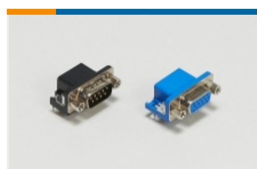
PCB D-Sub Connectors(191)