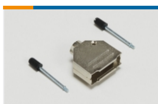
D-Sub Backshells & Clamps(31)